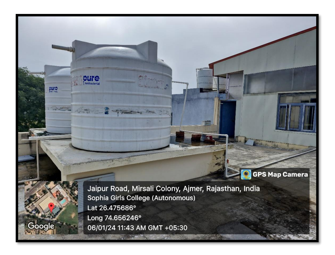
Water Storage Tanks